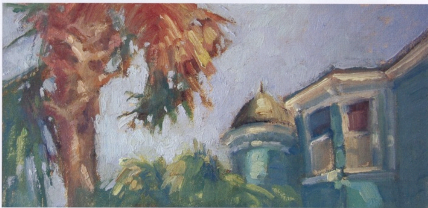
KAREN HEWITT HAGAN, SHADOWS ON RUTLEDGE, OIL ON CANVAS, 6 X 12"