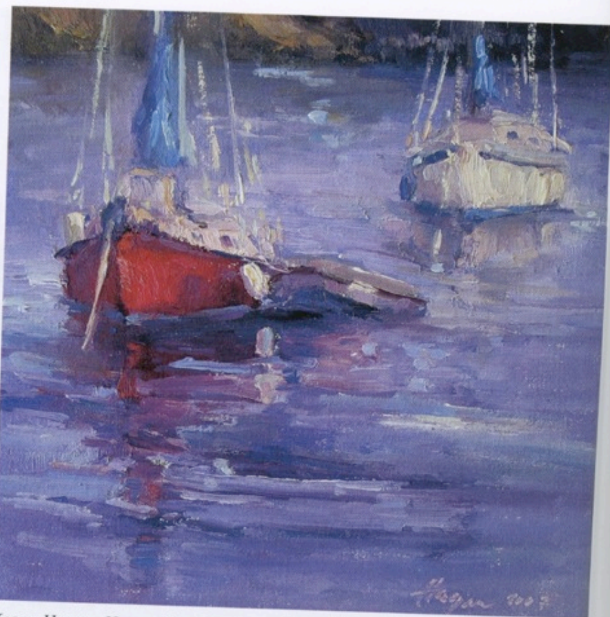
KAREN HEWITT HAGAN, RED BOAT, CHARLESTON HARBOR, OIL ON LINEN PANEL, 8 X 8"