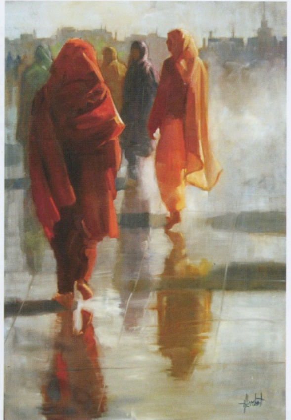
Hilarie Lambert, Reflections in Color , 36" x 24", oil on canvas